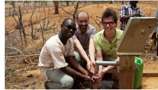
Yako School, BURKINA FASO