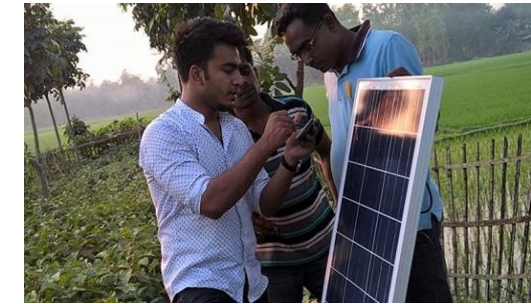
Sylhet District, BANDGLADESH