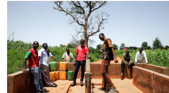
Wara, BURKINA FASO