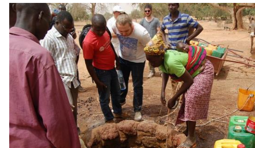
Zaibtenega, BURKINA FASO